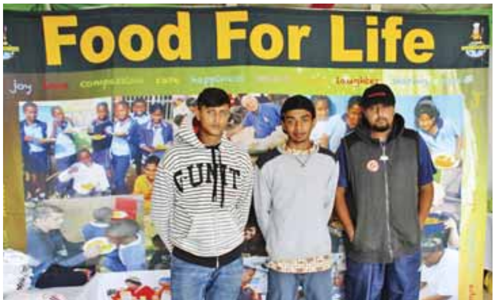
The Food for Life team provided delicious vegetarian meals to residents.