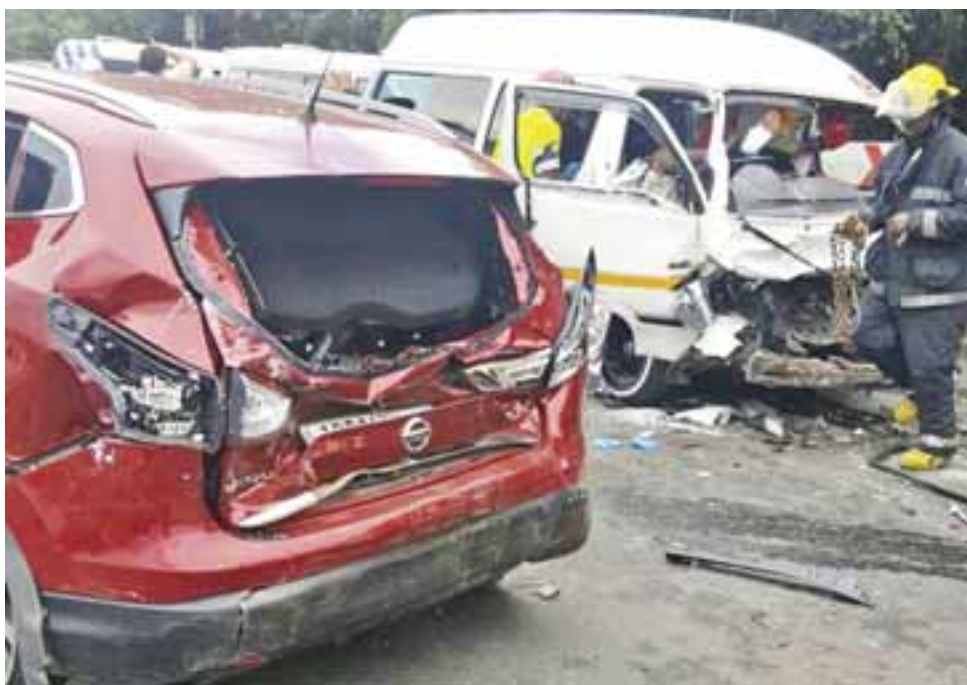
The taxi and car which were involved in the incident.