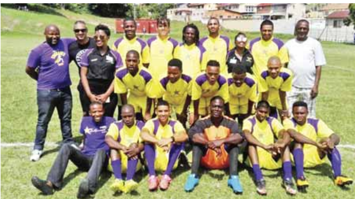
Members of the Summerfield Dynamos Football Club show off their new sports gear.