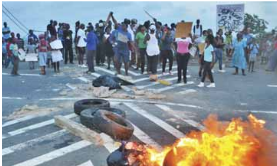
Protesters burned tyres on Lenny Naidu Drive.