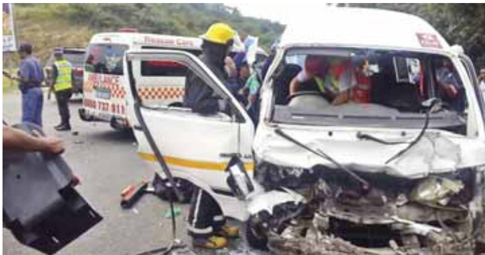
The relevant authorities worked fervently at the scene.