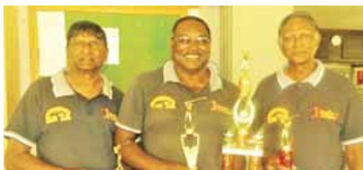
The winners proudly display their trophies.