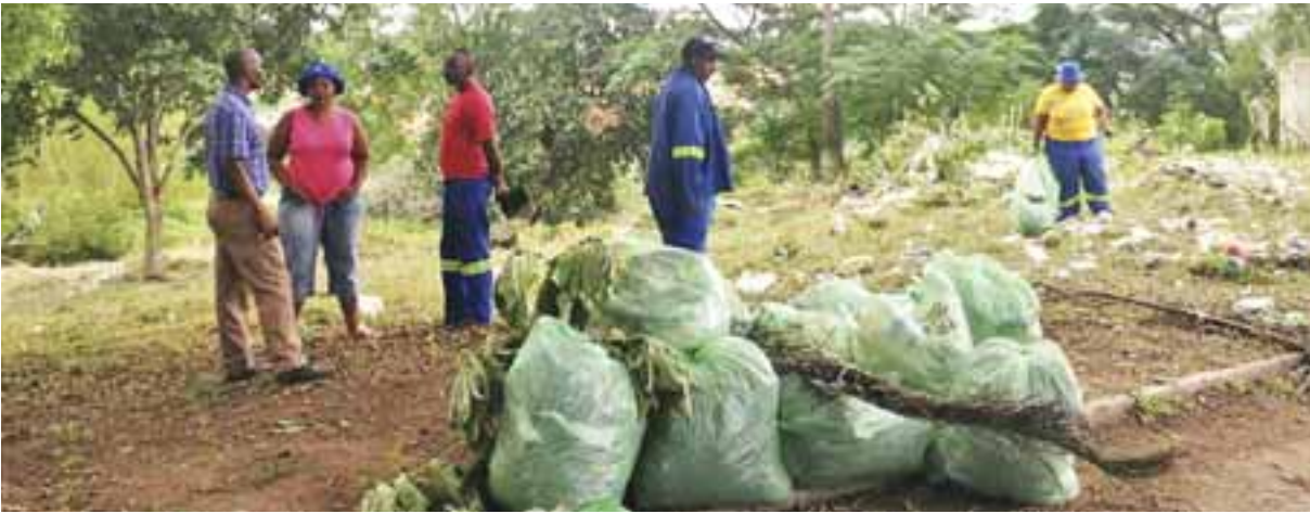
The clean-up operation was welcomed by the Shallcross CPF.

Residents interested in the operations can call 083-495-1611 or email shallcrosscrimeforum@yahoo.com