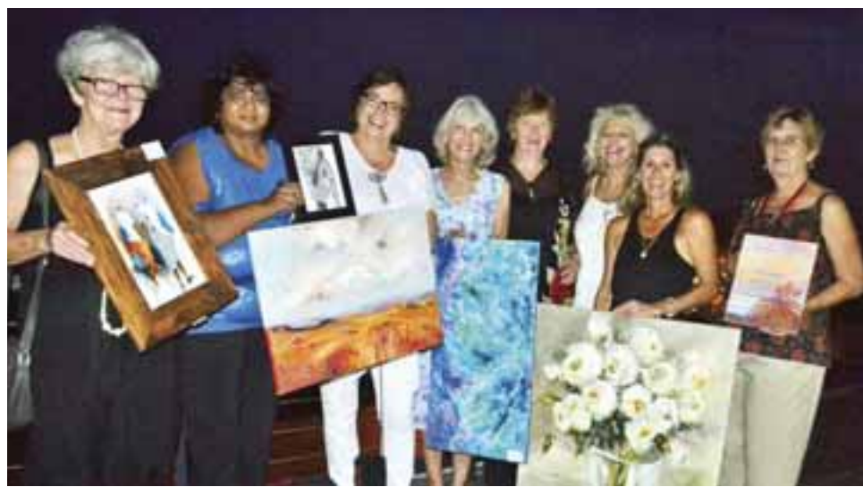
The talented artists are extending a warm invite to members of the public to come through and have a look at the amazing work.

WE CARRY THE BIGGEST RANGE OF CAR AUDIO IN AFRICA NOW STOCKING STARSOUND & AUDIOBANK WHOLESALE FOR DURBAN PUBLIC WELCOME-R300 MINIMUM PURCHASE-CASH ONLY WE RESERVE THE RIGHT TO LIMIT QUANTITIES ALL PRICES INCL VAT-E&OE WE DO SPECIAL PRICE FOR WHOLESALE CUSTOMERS ACTUAL PRODUCTS MAY DIFFER FROM PICTURES