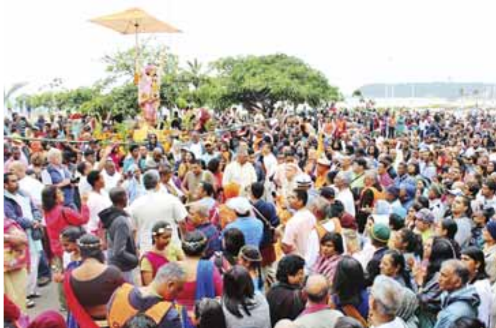
Thousands of Durbanites gathered at the Festival of Chariots.