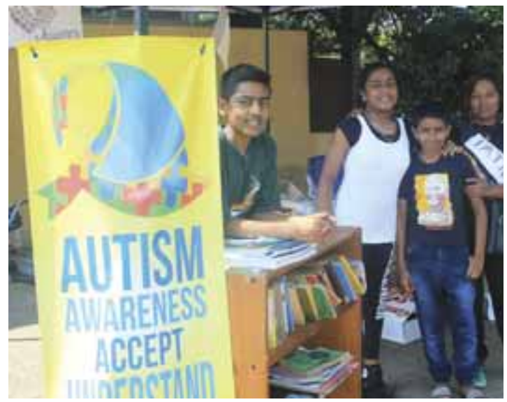
The group can create a sense of community and lessen any feelings of isolation from the wider community that people who are affected by autism may feel.