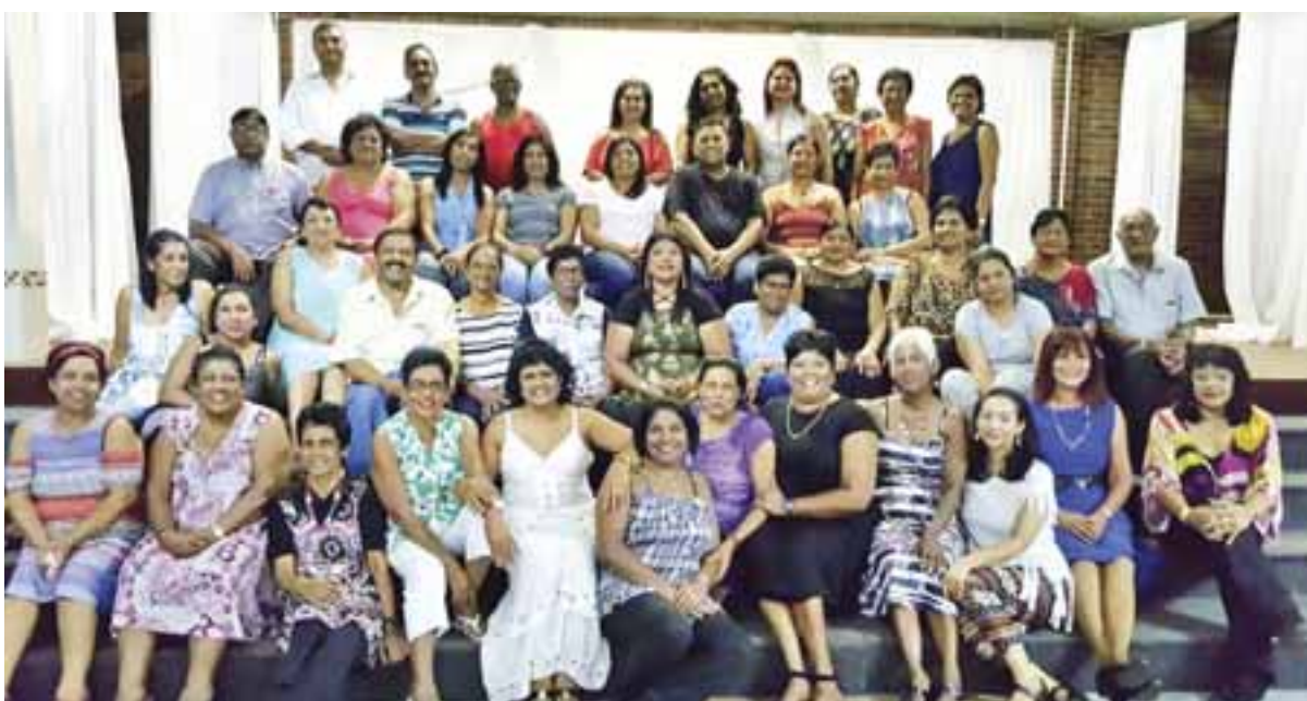
The Love to Dance Group, a non-profit organisation involved in getting people together to socialise and keep fit, held a memorable evening of song and dance at the Westpark School Hall, recently. Seen are some of the members of the group at the event.