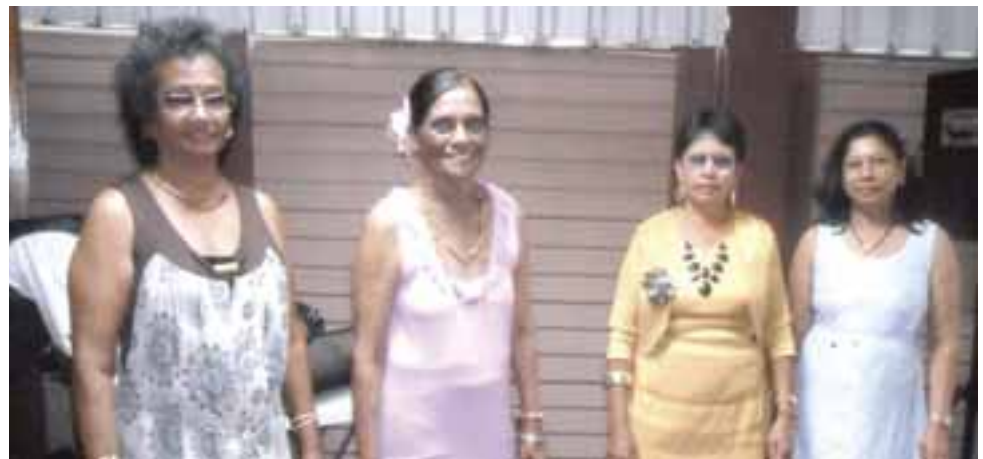
Dedicated members of the Chatsworth Service Centre recently treated themselves to a fun-filled day following several community initiatives. The members enjoyed the day thoroughly and said that it helped them spend quality time together as well.

CLASSIFIED DEADLINE STRICTLY SATURDAY AT 12:00PM