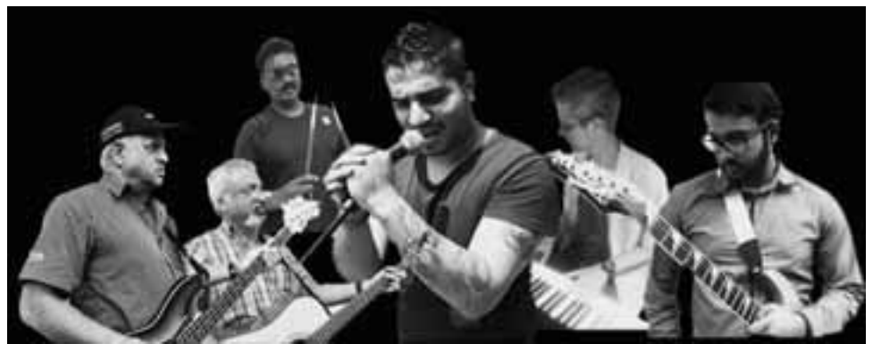
The talented band, Track.

The striving swimmer said that he feels very blessed to be one of the very few people who are an inspiration to other teenagers. He strongly believes that the community is in need of more youth serving as an example to the younger generations to come.