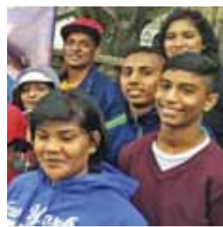
The successful event united the community.