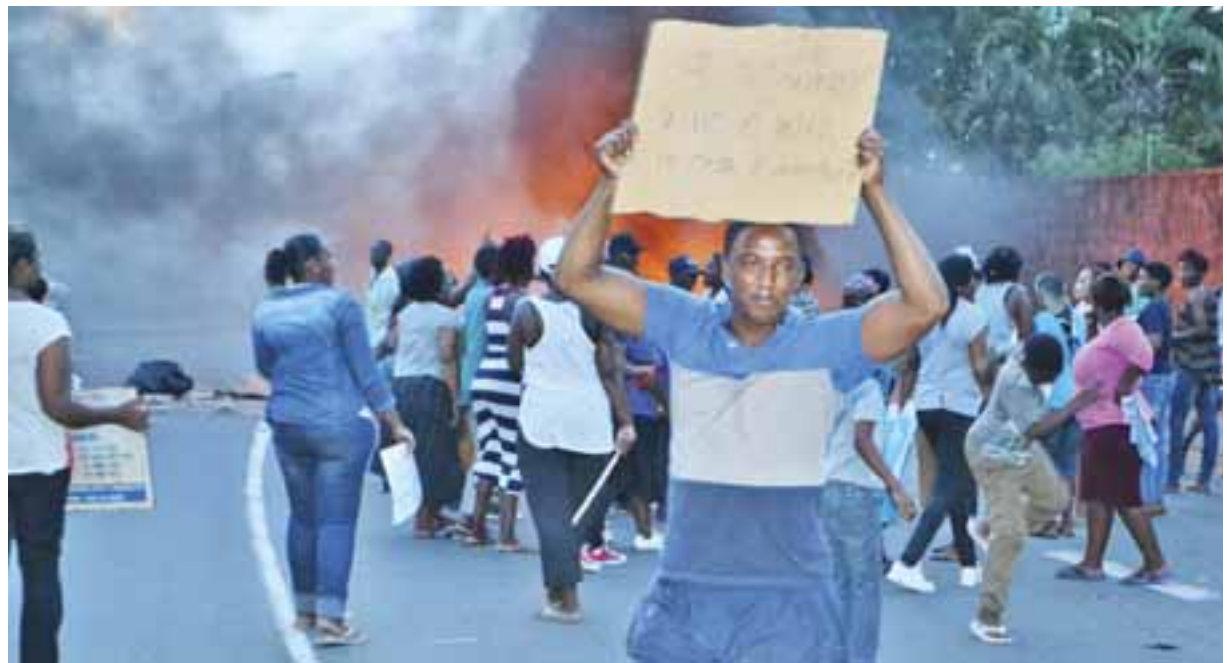
One of the irate residents who protested over the lack of service delivery.