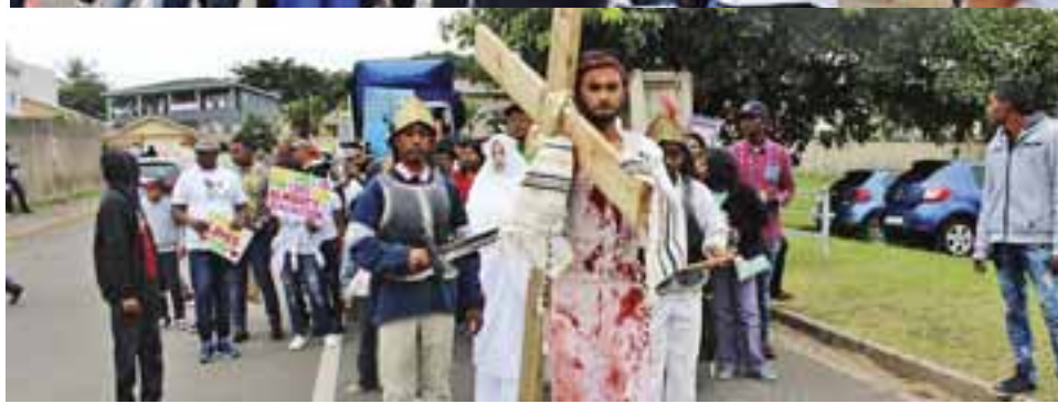
Thousands of residents attended the annual event.