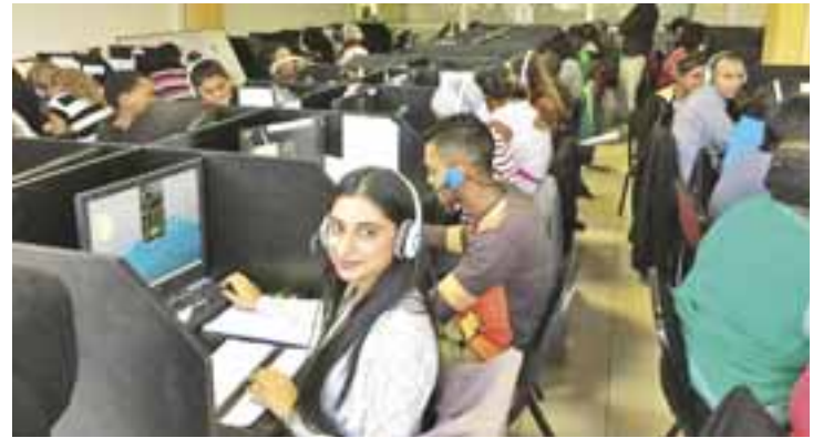
There is guaranteed employment for 70 percent of youth who complete the learnership.

The Dreamcatchers (a career guidance programme of the Nelson Mandela Chatsworth Youth Centre) has teamed up with DJEM Marketing to train youngsters and provide jobs. Unemployed youth are encouraged to enrol for the accredited NQF4 learnership programme. There is guaranteed employment for 70 percent of youth who complete the learnership. Those selected for the programme will also earn a stipend during the training period. Young people interested in applying for the learnership must attend a