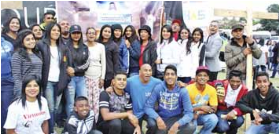
Members of Emmaus Fellowship supported the march.