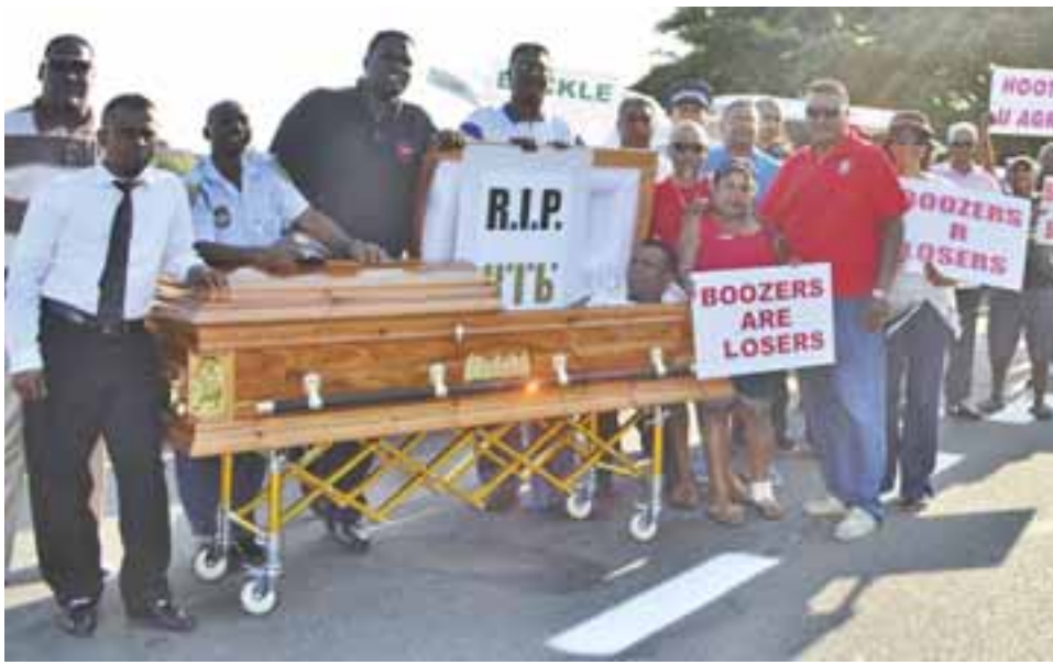
Community members, together with various organisations, who were present at the event.