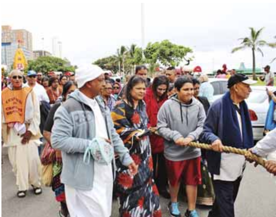
Hare Krishna devotees pull the chariots along the streets of the Durban beachfront.