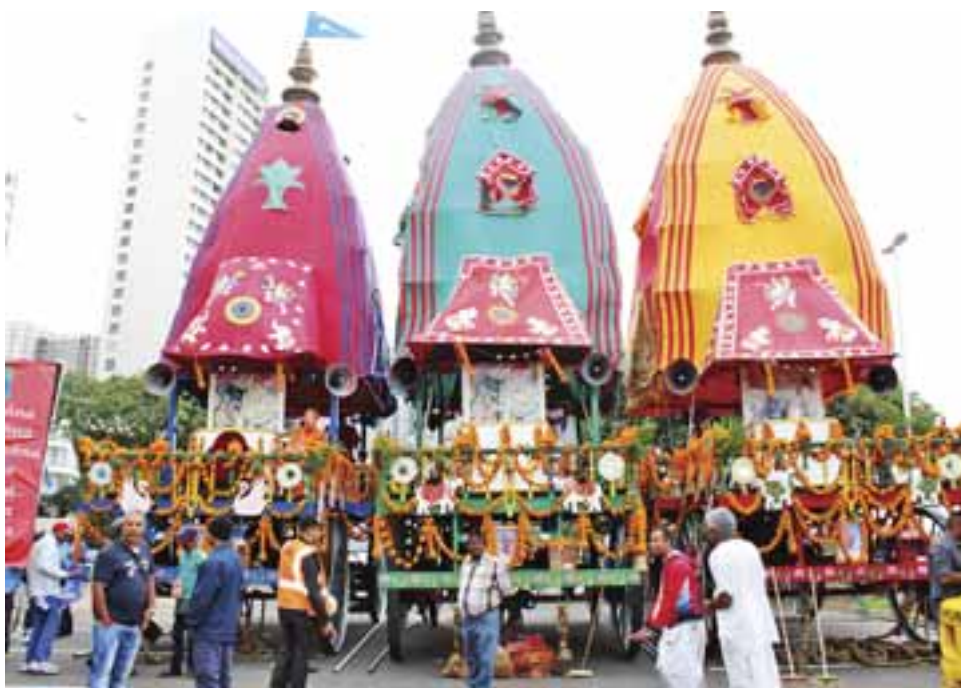
The beautifully decorated chariots added colour to Durban.