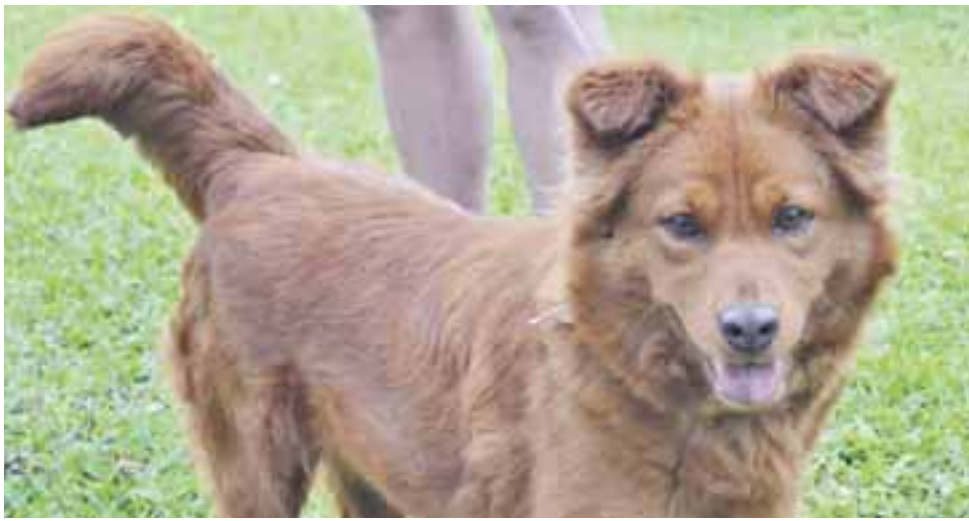
Roxy was adopted by a new family in October, last year.